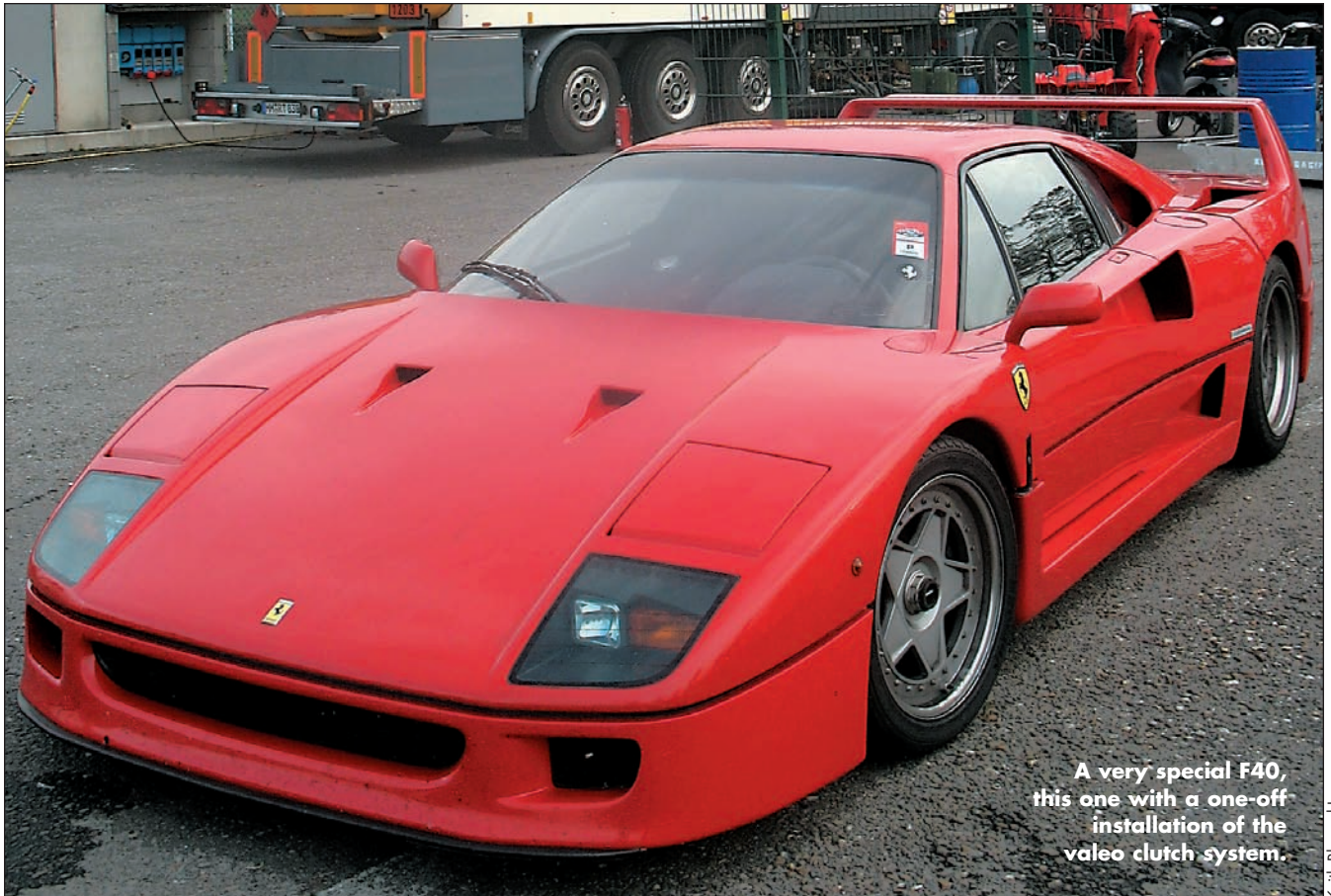
A very special F40, this one with a one-off installation of the valeo clutch system.